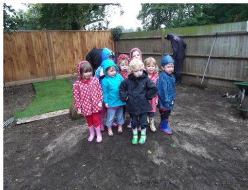
The children lend a hand to compact the soil prior to turfing

If you have not had a chance to see our garden recently please do have a look, you will be amazed at it’s transformation!